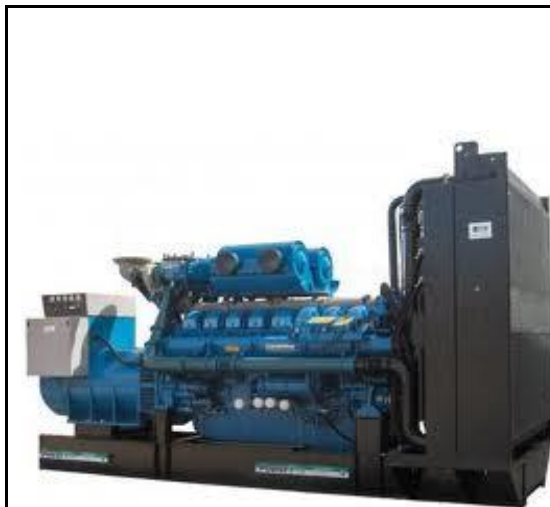
Photo may be demonstration or a different size generator

Standard Reference Conditions air inlet temperature 25°C , barometric pressure 100kPa [110m altitude] and 30% relative humidity.