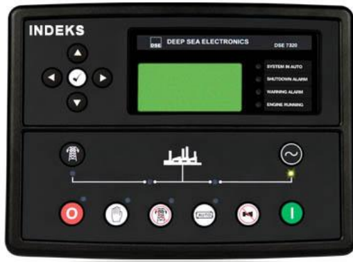
Photo may be demonstration or a different size generator