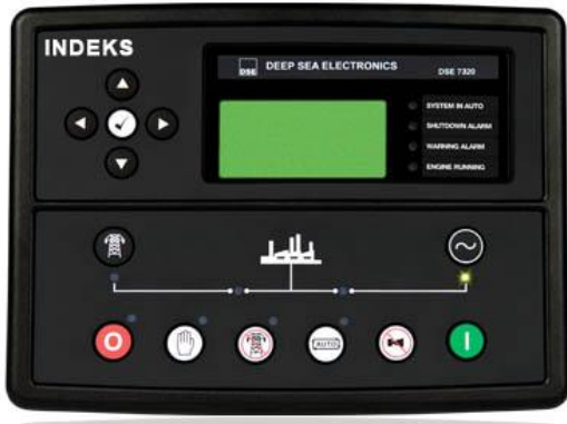
Photo may be demonstration or a different size generator