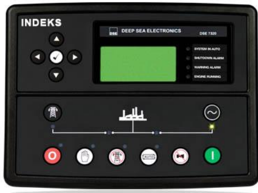
Photo may be demonstration or a different size generator