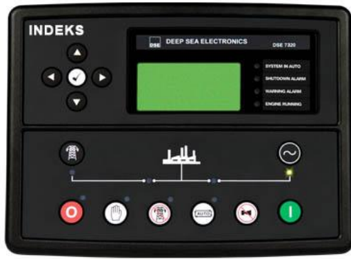
Photo may be demonstration or a different size generator